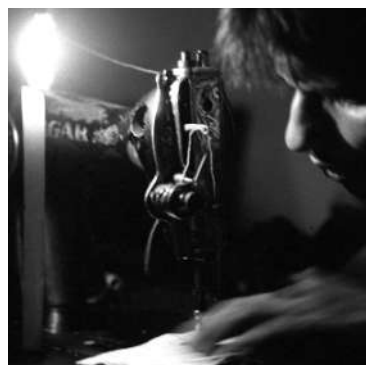
Tailor working by candlelight in an "electrified" village in India.

WLED technologies provide more and better illumination (with easier optical control) than do fuels (fig. S4), dramatically reducing operating costs (table S2) and greenhouse gas emissions, while increasing the quality and quantity of lighting services. Efficiencies of only five delivered lumens per watt in the mid-1990s are moving toward 100 lumens per watt (compared with 0.1 lumens per watt for a flame-based lantern). Relative